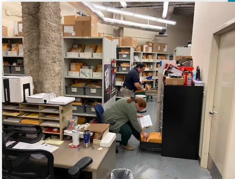
The secure evidence storage area is audited on a regular basis.